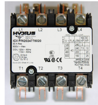
4-Pole Contactor Part # 2024778020