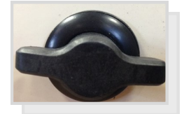
Outer Door Lock

For more information, contact your local Irrigation Components branch.